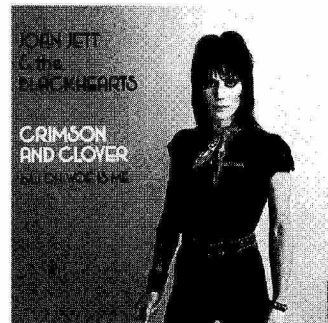
3. Joan Jett & The Blackhearts 319